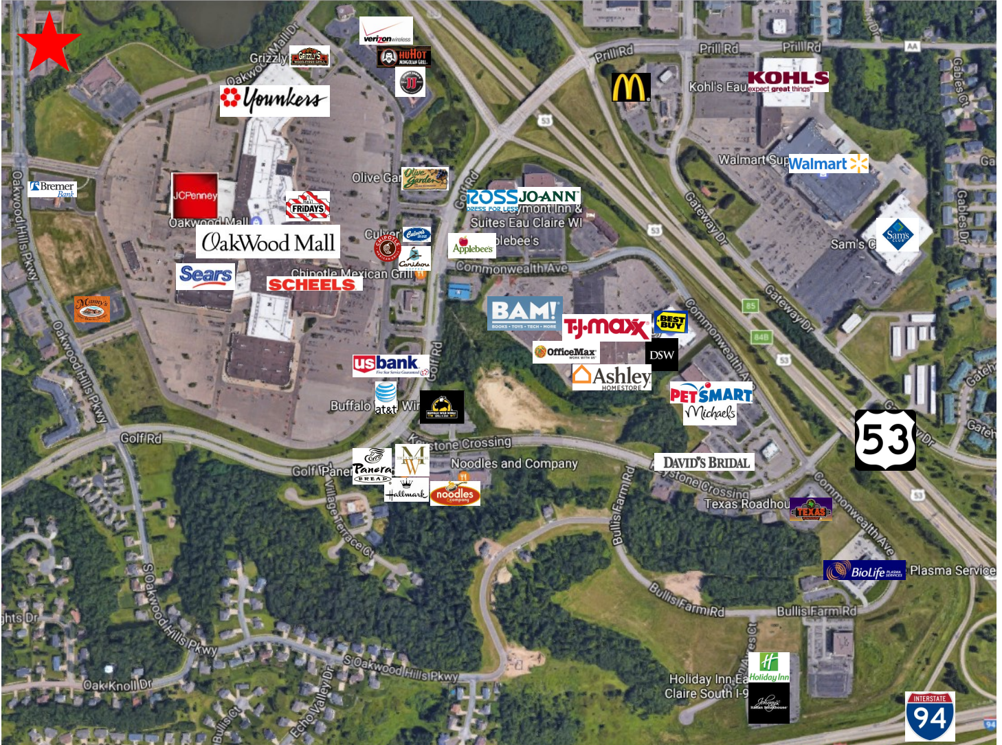
Google Maps, 2017