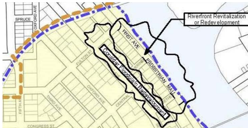
Recommendation from the Neighborhood Plan

Developers of the Neighborhood Plan addressed a desire for revitalization or redevelopment of the area encompassing the development opportunity. Specifically, the Neighborhood Plan sets forth a strategy of capitalizing on the riverfront access these properties have. Proposals should include specific reference to how the development will achieve this strategy.