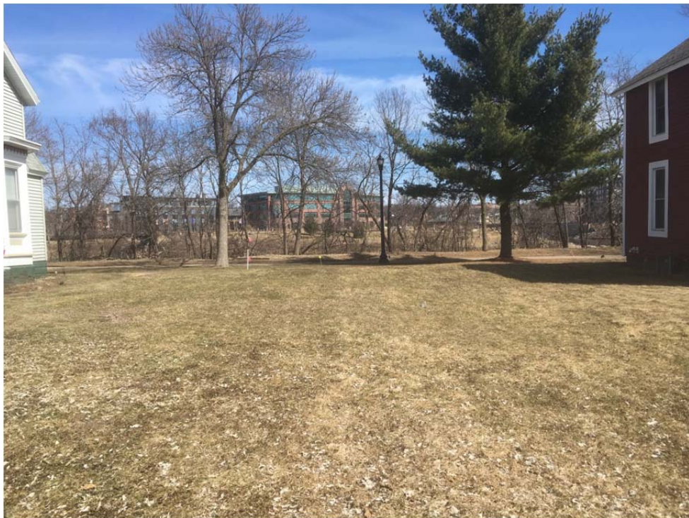
Looking east toward the parcel