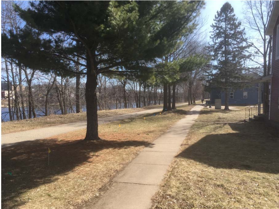
Looking south from the parcel