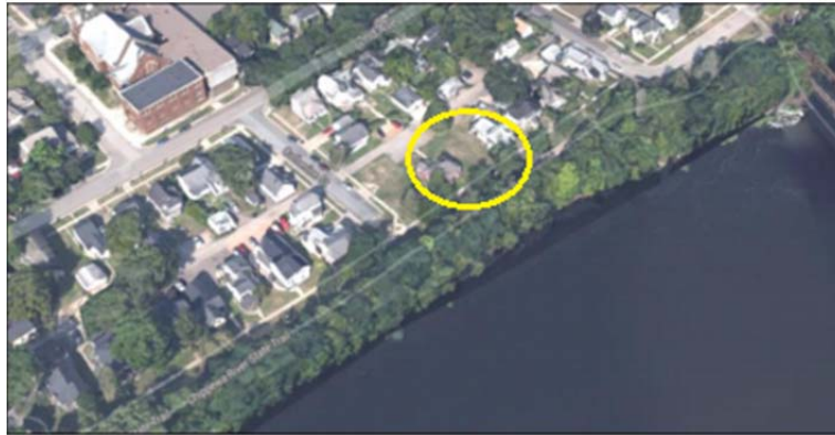
Aerial view of the development opportunity (circled)

Setback requirements away from adjacent structures prohibit construction on the parcel at 1008 1 st Avenue. As a result, the parcel must be combined with an adjacent parcel to facilitate construction. The successful respondent will have the opportunity to combine this parcel with an adjacent parcel to increase the amount of buildable space for residential development.