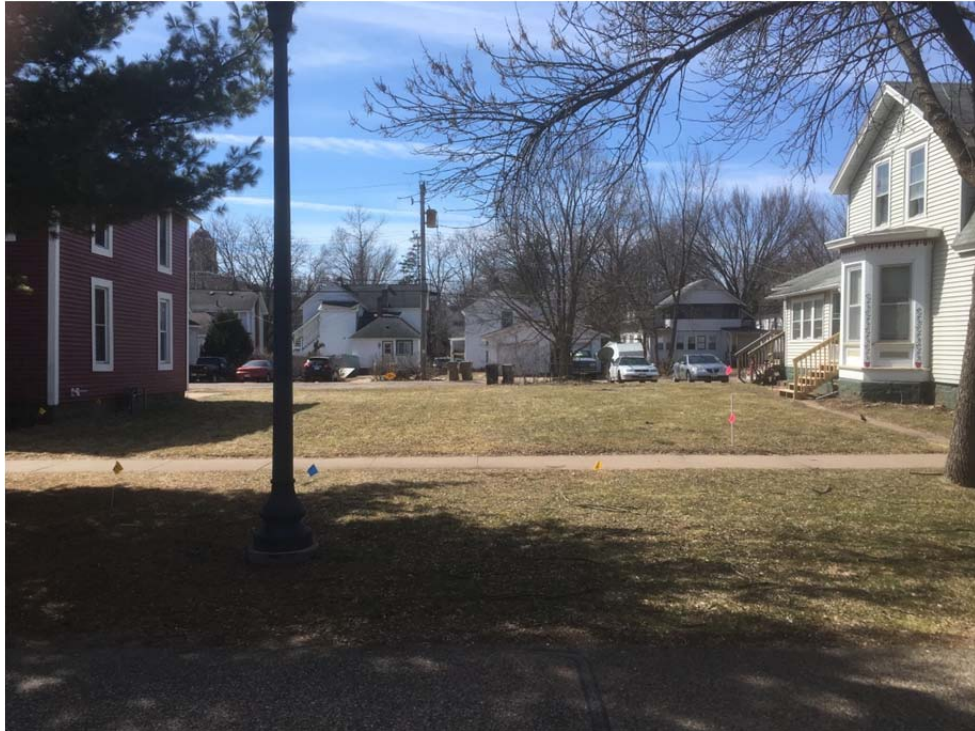
Looking west toward the parcel