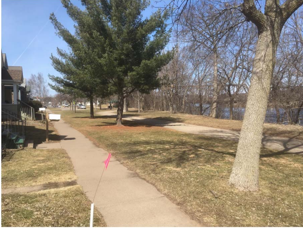
Looking north from the parcel